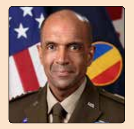
GENERAL GARY M. BRITO, USA Commanding General, U.S. Army Training and Doctrine Command (TRADOC)