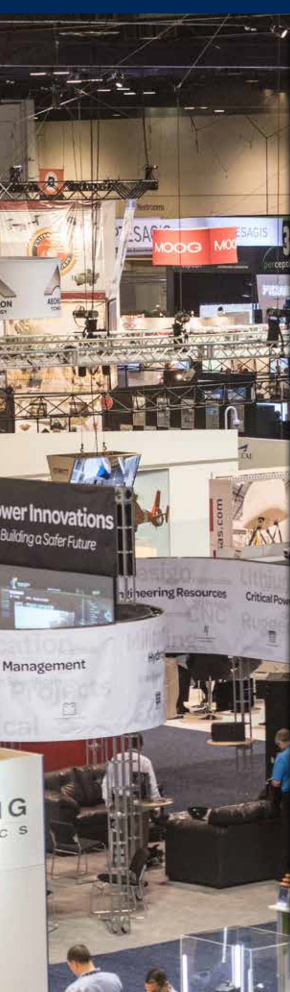
EXHIBIT HALL MARKETING